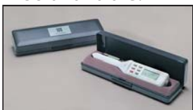
Hard Plastic Protective Case - Protect your investment