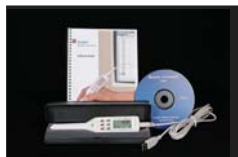
Scale-Link USB - Computer - Input Plan Scaler